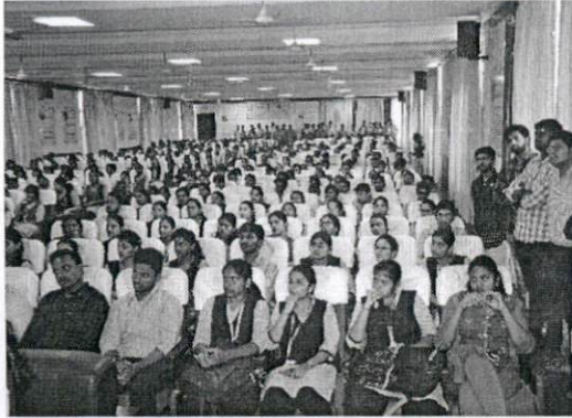
Civil Services Aspirants attending orientation session on 23-Jun-16